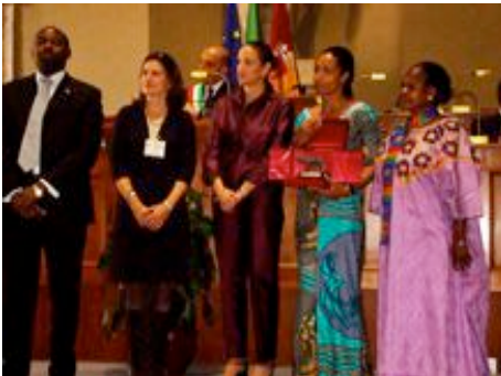
To Be Worldwide wins award