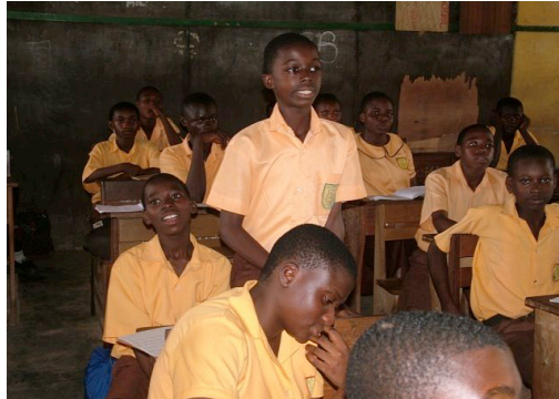
Kids in class at school