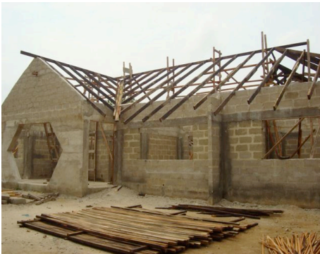
Cape Coast Centre progress