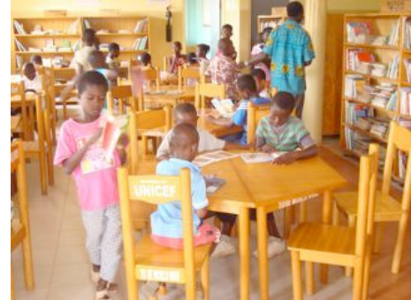
Daily scene at the Library