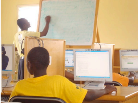
Kids in computer class