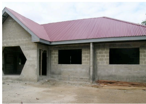
Next phase Cape Coast Centre