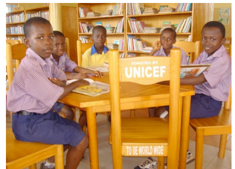
Kids in Library