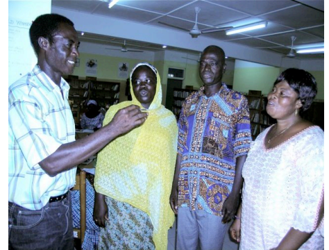
Adult literacy course