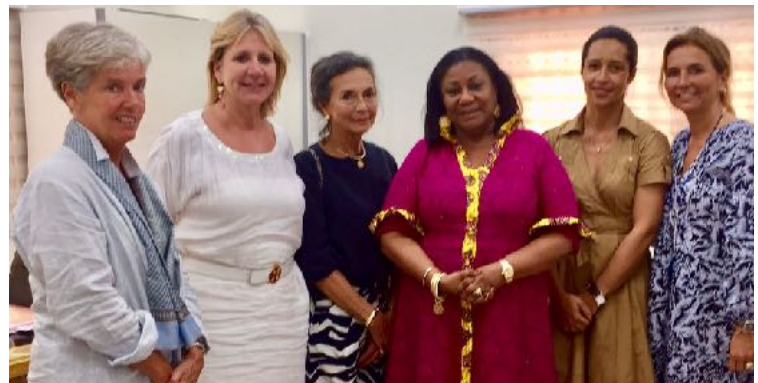
First Lady in pink

To Be Worldwide was given the opportunity to present its work to the new First Lady of Ghana. We hope that with our work we will be able to contribute towards helping solve the national issue of lack of access to computers in the public education system and to bring the joy of reading to communities with our library facilities. We are looking forward to another opportunity soon to further explore ways to cooperate.