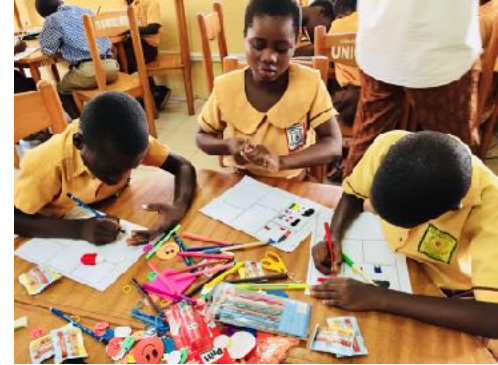
Who does what?