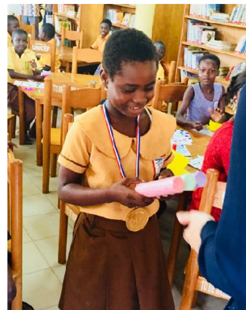
Congratulations! First prize :-)