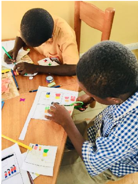
Putting the Cartoon Together