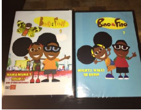
There was enough material to use

Now that was a fun, creative and challenging workshop! First we watched a cartoon called “ Bino & Fino ” by a Nigerian artist. Using that as inspiration, we ask the children to work in groups, think of a short story, each one of them to draw a part of the story and at the end put the whole story together. The children were totally free in how they wanted to approach the assignment. It was wonderful to see how much fun they had and how easily they were able to agree on the roles each of them would take in order to make a fun cartoon! Of course all the handwork was rewarded :-)