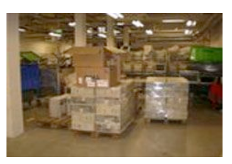
Pentium IV's ready for shipping