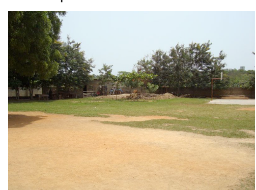
40 x 40 meters in Cape Coast land next to a school and serving 12 other schools

Resource Centre to other areas besides Takoradi . We have identified 2 locations to develop. One in Cape Coast and one in Anaji. A memorandum of understanding on the use of the land in Cape