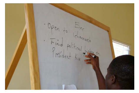
prince teaching the kids