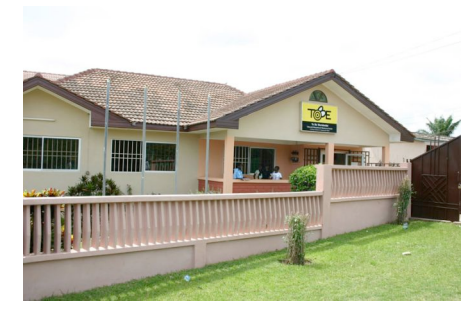
Takoradi Educational Resource Centre