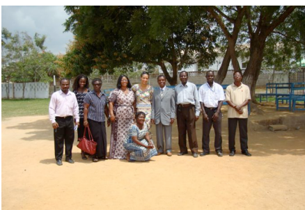
Cape Coast land owners & To Be Team