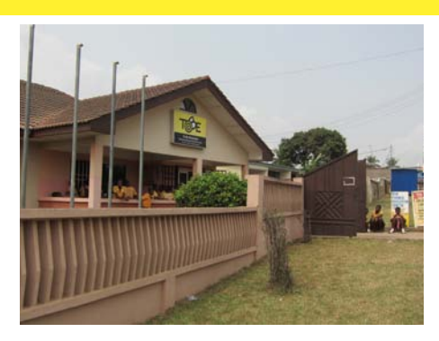
Takoradi Centre at its best....lots of kids