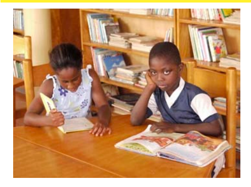
Time to read at the Centre