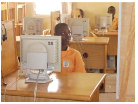
ICT classes within school curriculum