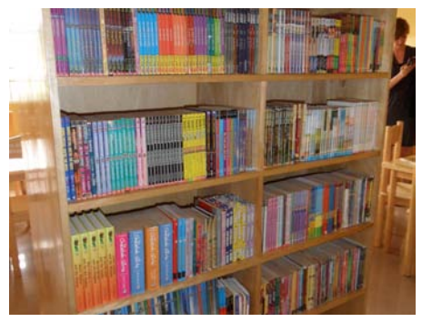
Bookshelf at Cape Coast Centre