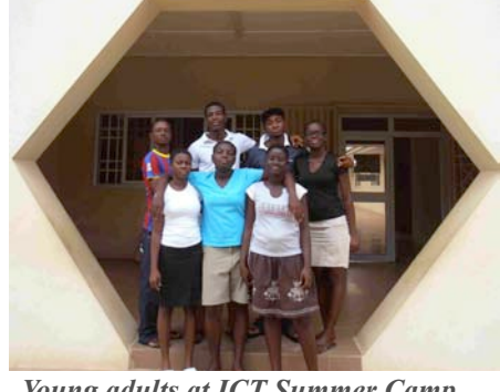
Young adults at ICT Summer Camp