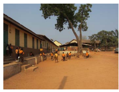
Cluster of schools in our community