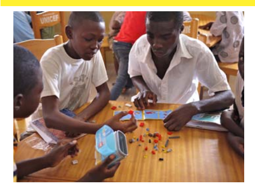
Lego activities at Centre