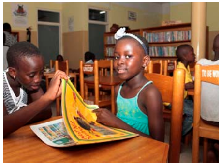
Reading is fun...