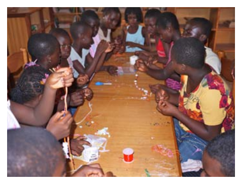
Making jewelry at the Centre