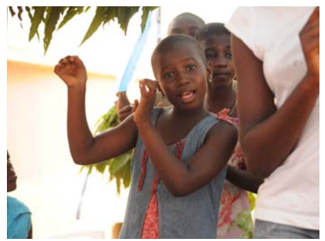
Singing activities at Centre