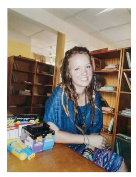
Picture taken by Cephas 10 years old during the digital photography course

One of my main projects is the Reading Club, which Gery started. We work with two groups of students and a teacher from two of the local schools to give them specific attention. These children are selected due to the difficulty they experience with