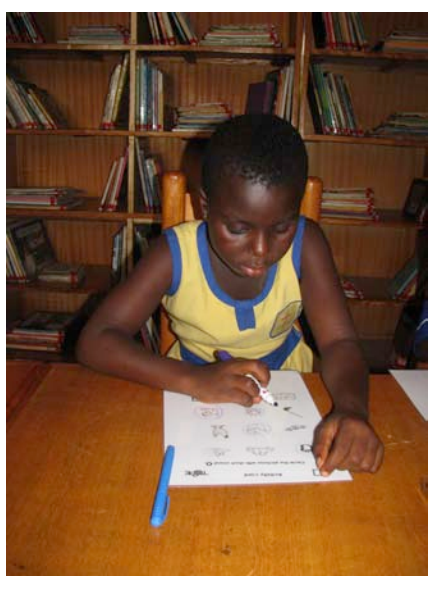
On to the next activity