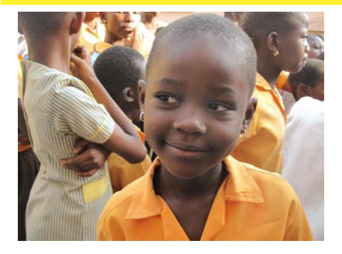
The To Be Worldwide curiosity Look