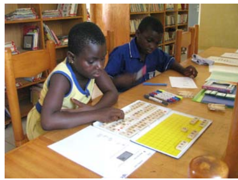
working on their individual language activities