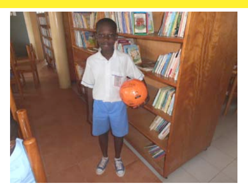
Awarded for a great essay