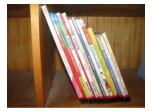
Books in the Library are now colour coded