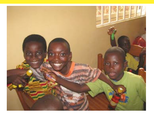
Christmas party fun