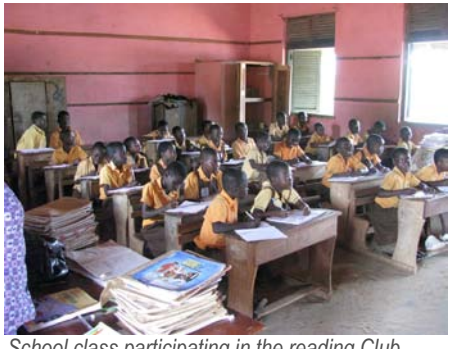
School class participating in the reading Club