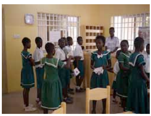
Kids queuing at Cape Coast Centre Library