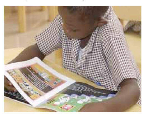
Simply wonderful to watch