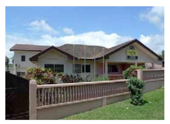
Takoradi Centre in it splendour