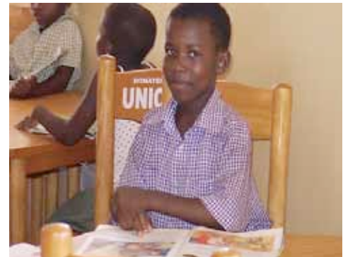
Enjoying his book