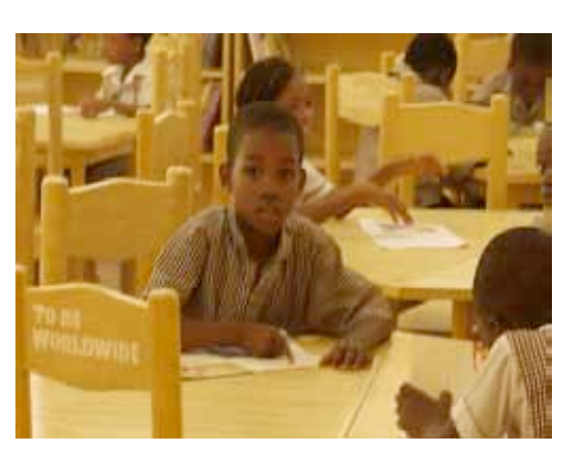
so sorry to have disturbed you.....