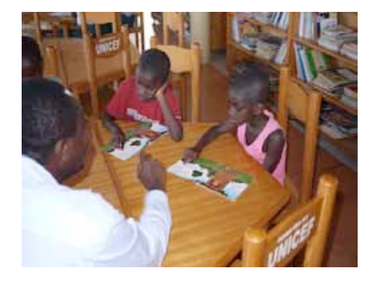
a reading class at Takoradi Centre