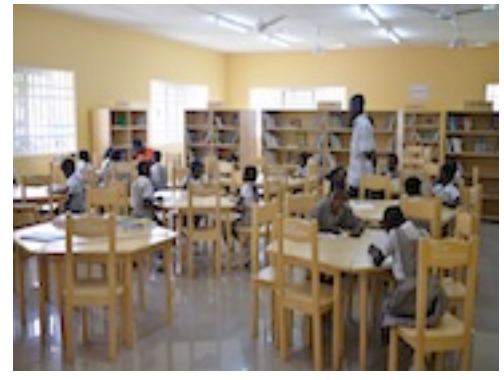
Library at Cape Coast Centre