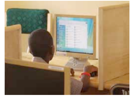
ICT classes taking of in Cape Coast