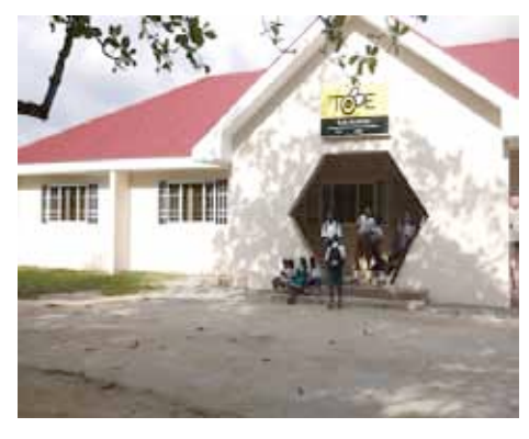
Hanging out at the Centre in Cape Coast