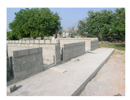
Building process of the Cape Coast Educational Resource Centre