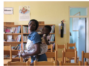
An interested parent