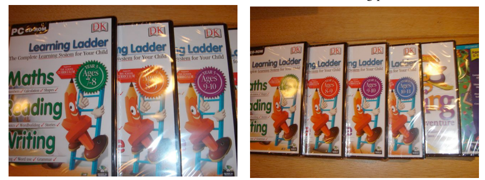
Learning ladder on Maths, Reading and Writing for every class

This software will be placed on the server so that it can be accessed from every computer.