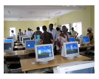
Parents viewing the classroom